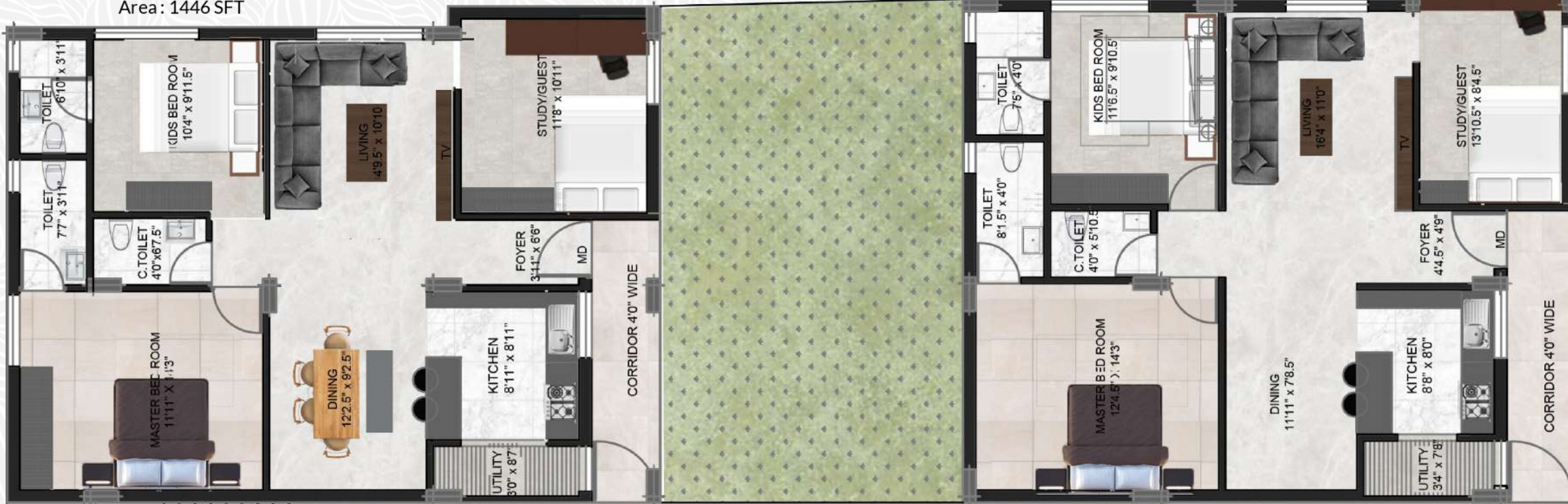
East 3BHK Area: 1446 SFT